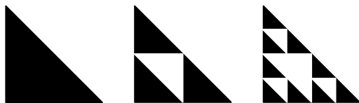
Fig. 1. Sierpinski gasket

Self-similarity, possible only for geometric fractals, is achieved only at infinity when every tiny part is identical to the whole. Fractal properties include scale independence infinite length or detail.